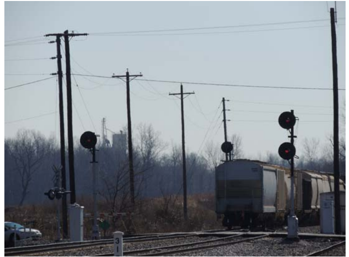
Searchlight Signals stand guard at South Henderson while the rear of Q515 passes.

If you know of regional events we can put on the Timetable, please forward those to me, bill@fbcmadisonville.com .