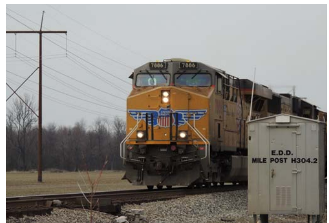
Above: Union Pacific ES44AC 7886 passes the detector at Busby Station Rd north of Robards with Q515. UP power has become a semi regular sight on the Henderson Sub in the last two months.