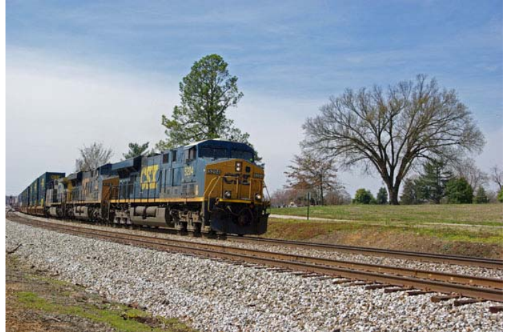
Above: CSX Intermodal, Q124, northbound at S Latham, April 6, 2013.