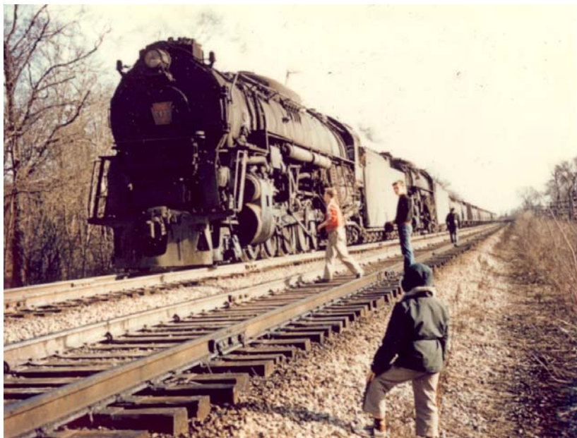
Left: Fred Ripley submitted this vintage shot: ca. 1955, of WB train of N&W coal, leaving Columbus for Chicago on the PRR, behind two J-1 2-10-4's. The train looks to be stopped when this photo was taken, but should have no trouble with two of these TX-types.