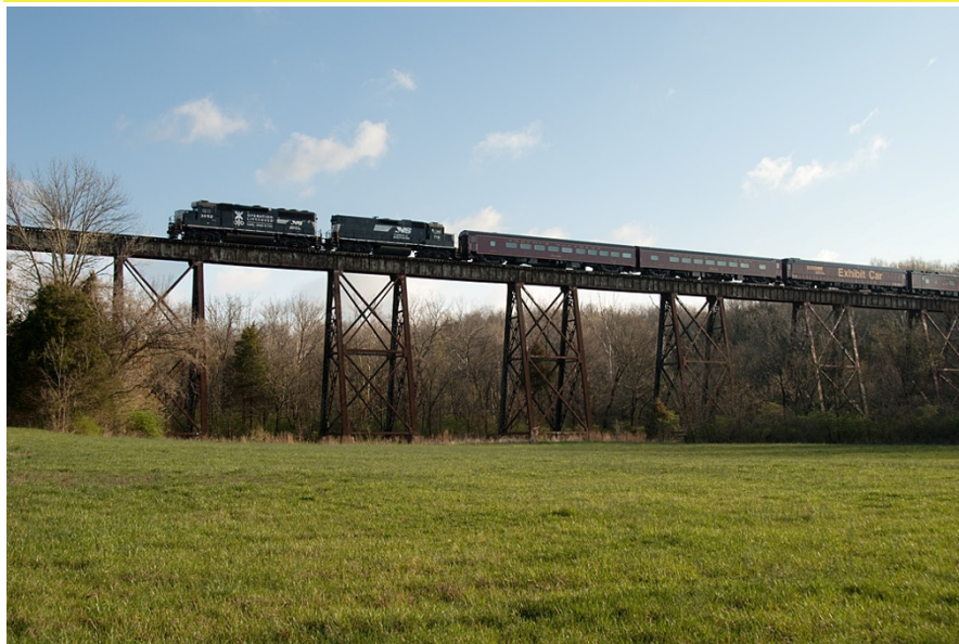
Left: Bill Grady shot this NS Operation Lifesaver train on Pope Lick Trestle, east of Louisville.